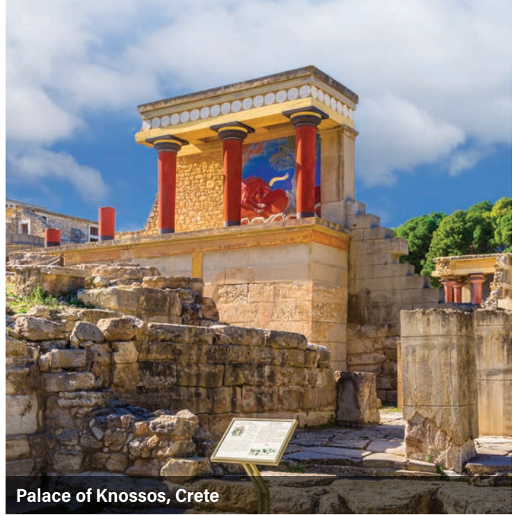
Palace of Knossos, Crete