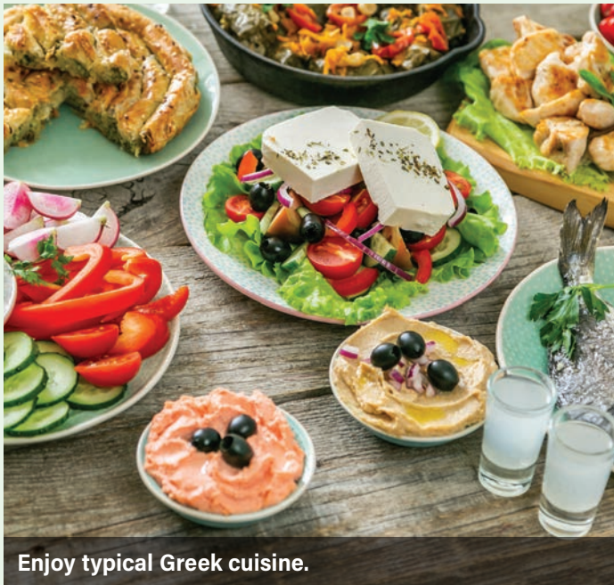
Enjoy typical Greek cuisine.

NOT INCLUDED: International airfare; travel insurance; expenses of a personal nature; any items not mentioned in the Itinerary and the Tour Inclusions.