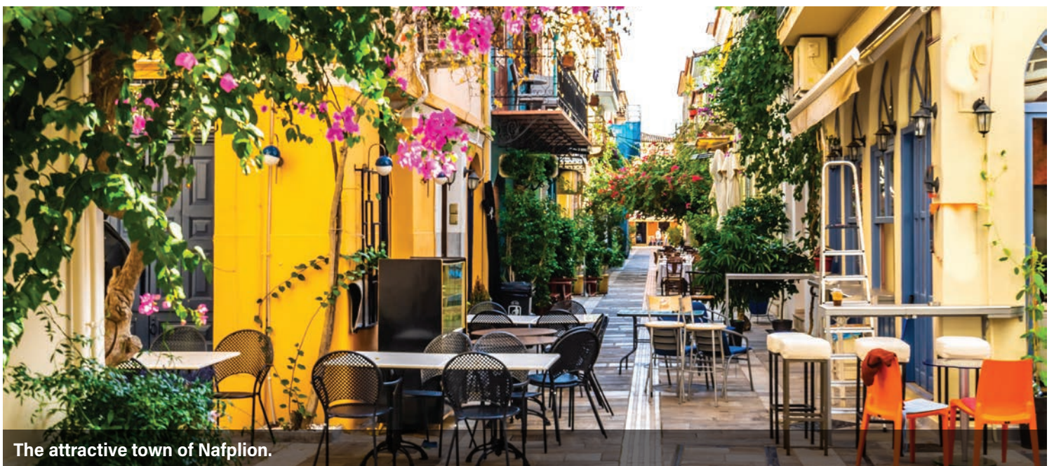
The attractive town of Nafplion.

For those interested, an optional 2-day extension to Athens will be available. Arrangements will include accommodations at a deluxe hotel, tours of the city's main ancient monuments, a lunch and a dinner at local restaurants, and hotel/airport transfer.